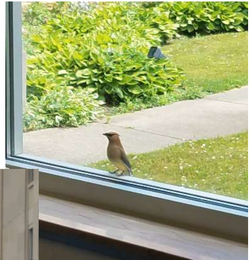
This little friend has been a frequent visitor to St. Paul's lately. She(?) likes to stare in at us at work.