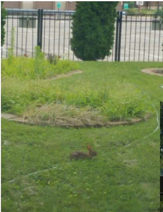
A visitor enjoying the St. Paul's memorial garden.