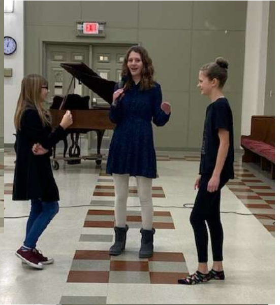
Our St. Paul's crew is a talented bunch! Coffee Hour Talent Show March 20, 2022